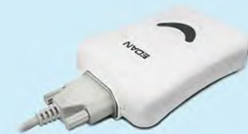
DP12 12-lead Wired Sampling Box