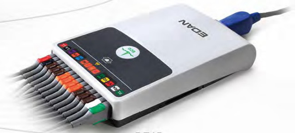
DE15 15/16-lead Wired Sampling Box

SE-1515 PC ECG provides you comprehensive ECG solutions, which integrates resting ECG, stress ECG and data management in one PC-based software. Its user-friendly interfaces and reliable interpretation helps increase patient throughput and improve clinicians' efficiency. With EDAN latest DE15 sampling box, clinicians are able to do standard 12-lead ECG tests, and also easily upgrade the tests into 15/16-lead only by adding 4 separated leads.