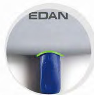
ECG Signal Quality Indicator