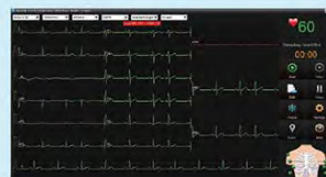
ECG Signal Quality Indicator

Standard and unlimited user-defined protocols are offered, facilitating your standard or customized stress tests.