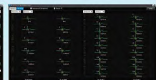
ECG Templates Comparison