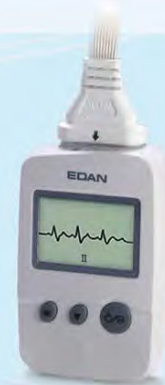
DX12 12-lead Wireless Sampling Box

SE-1515 PC ECG is able to archive reports from standalone ECG machines and provides clinicians on-screen ECG measurements for paperless workflow. Multiple report formats are provided which enables it more flexible for clinicians to choose their useful formats. It also can transmit ECG data to HIS/EMR/PACs via HL7 and DICOM worklist.