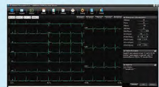
Proof of Diagnosis