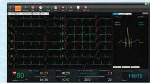
Auto Arrhythmia Detection

METs, Double Product, Duke Score as well as FAI are evaluated in your stress test, which presents clinicians more complete references to make proper decisions.