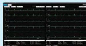
ECG Reports Comparison